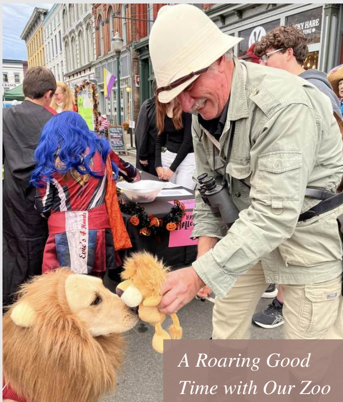
A Roaring Good Time with Our Zoo Keeper and Lion!