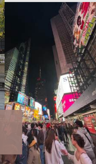
Big Apple vibes with Bella and friends!