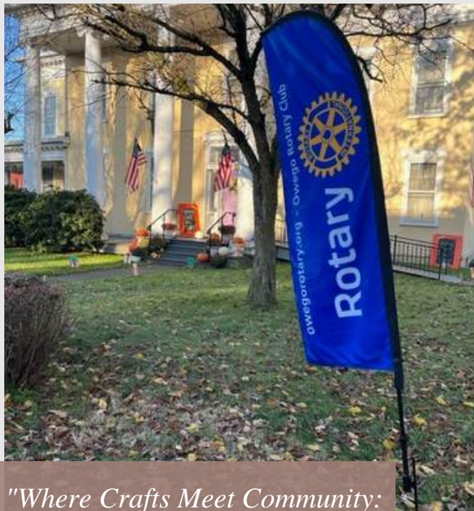
"Where Crafts Meet Community: Just Follow the Banner"

A steady stream of visitors came through to explore the booths, mingle with the creators, and enjoy the festive spirit. Many vendors reported selling out of popular items, showcasing the strong community support for local craftsmanship. The event also raised funds to support Rotary’s mission to eradicate polio, turning creativity and connection into a force for global good. Thank you to everyone who joined us and made this fair a memorable celebration of community and compassion!